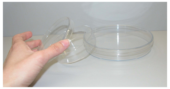
Two different sizes of tissue culture dishes

the sample port and an appropriate height to make the sample effectively opaque. Other brands are also acceptable as long as they are optically clear and completely cover the sample port.