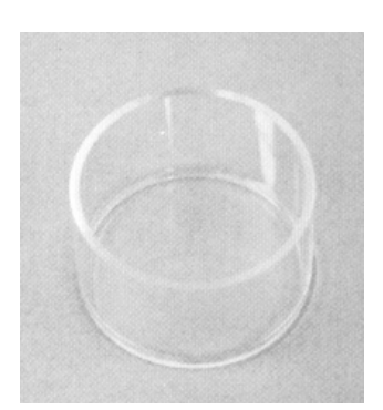
The 2.5-inch glass sample cup

The best measurement performance is achieved when HunterLab fused-silica sample cups are used because they are custom manufactured to HunterLab's specifications. Each cup is optical quality glass and a two-piece construct that is first fused glass-to-glass then annealed. Solvents will not affect these cups, as the two components are fused together at the edges, not glued, and they can withstand a gradual increase in temperature up to 450°F (232°C), though beware that your instrument's port insert probably cannot! The dimensions, face quality, and flatness of the cups are monitored by HunterLab Quality Assurance. For critical measurements, these glass cups are recommended, since the sample will be viewed through the glass bottom of the cup.