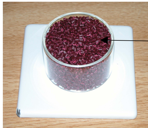
The glass bottom of the sample cup