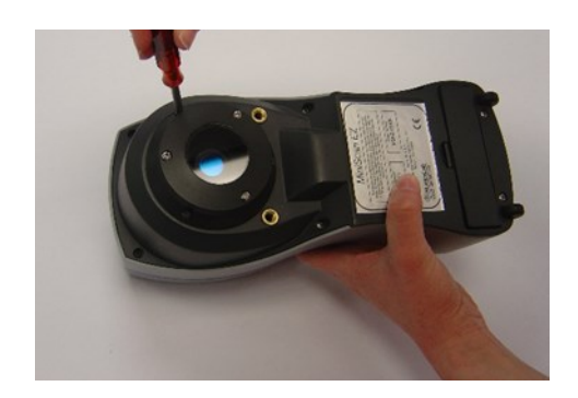
Nose Cone Installed

Installation: The nose cone/port cover is generally in place when the MiniScan EZ is shipped from the factory. However, if installation is required, place the assembly over the instrument port and secure it using three Phillips-head screws. If the glass or plastic cover is to be replaced, remove the three machine screws with lock washers, replace the window and the O-ring, and secure it using the machine screws.