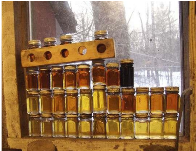
Maple color grading regulations require instrumental analysis for color quality monitoring.

UV/VIS (Ultraviolet/Visible) spectrophotometers are ideal for measuring both liquid and solid color samples. With a large photometric range...sample dilution is not required for highly absorbing samples such as maple syrup. Using the proper liquid sample holder and developing an average sample reading is a priority when measuring high viscosity sticky substances. HunterLab spectrophotometers offer this and the ability to adapt to larger surface area measurements, making them a versatile tools for the maple syrup industry.