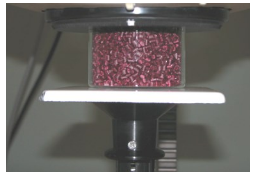
Cup of pellets held in place at the sample port.

When measured with glass, the pellets appear slightly darker (lower L*) and less saturated (lower a* and b*) than when measured without glass. The spectral plot shown below also illustrates the differences detected instrumentally.