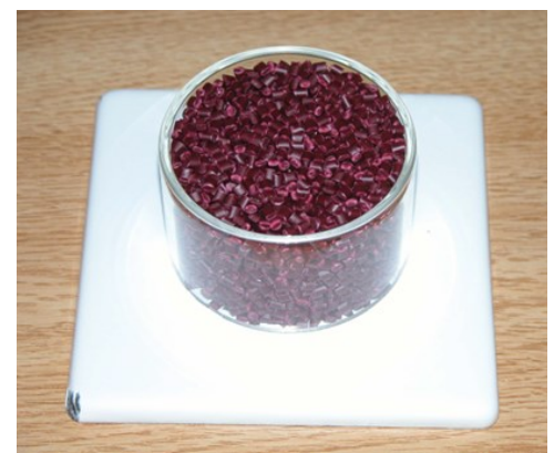
Glass bottom of the sample cup is measured with white tile holding the pellets in place.