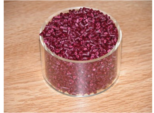
Plastic Pellets in Sample Cup.

As an illustration, the plastic pellets shown above were measured on an Agera with a 1.75-inch area of view, first with the pellets presented directly to the instrument, and then with the pellets measured through the glass bottom of the sample cup. This was achieved by mounting the Agera on the port-down stand and using the sample clamp and a white backing tile to hold the cup of pellets first right-side-up at the sample port (no glass in measurement), then upside-down with the pellets held in place by the white tile (measuring through the glass). (Please note that the measurements would not normally be made in this fashion. Pellets are usually measured with the Agera in the port-up orientation with the sample cup placed on top.